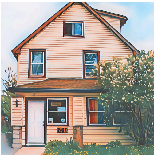
Victoria Street, Opened in 2004 Home to 7 men.