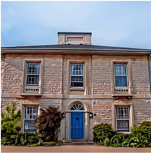
Clergy Street, Opened in 2021 Home to 7 men.