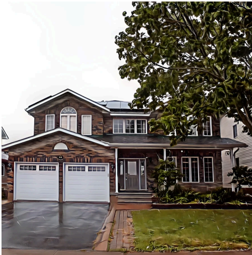
Fieldstone Drive, Opened in 2023 Home to 8 men.